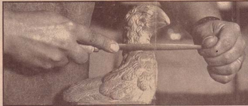
An artisan files a cast rooster at Rafanelli.